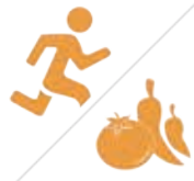
Diet and Exercise

The ORBERA® System is a tool that is designed to give you the extra help you need to adjust to a healthier lifestyle